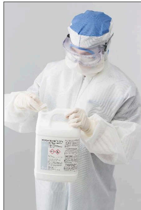
Opening a sterile 1 gallon HYPO-CHLOR 5.25% , SHC-02-5.25