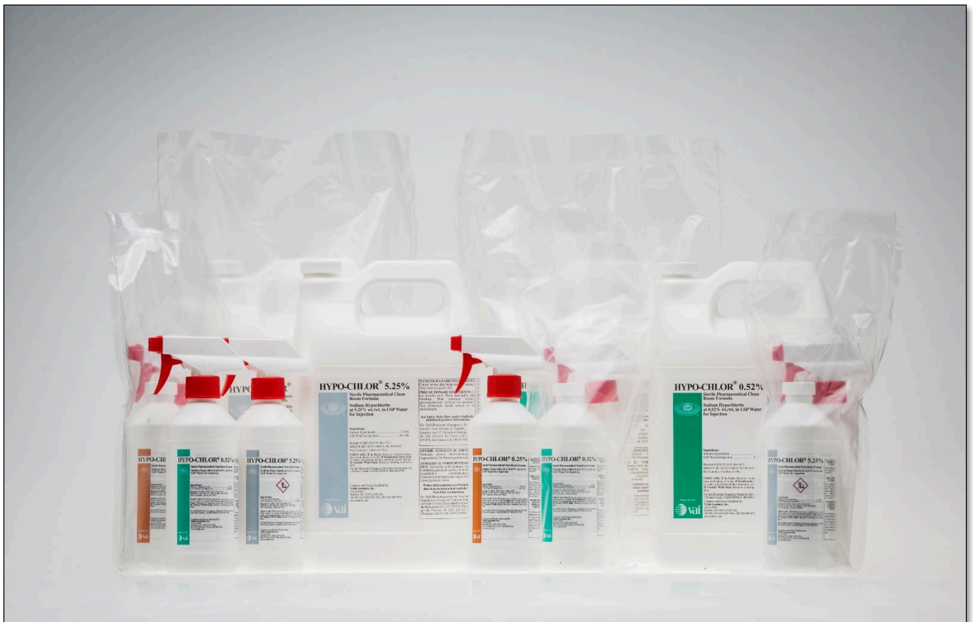
HYPO-CHLOR 0.25%, 0.52%, and 5.25% Family of Products

(Any specific product label is available upon request.)