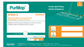
Baglabel PurMop® EFB40-S