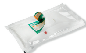
Bag with label