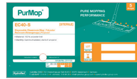
Baglabel PurMop® EC40-S