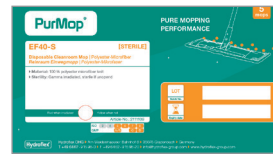
Baglabel PurMop® EF40-S