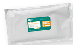
Bag with label