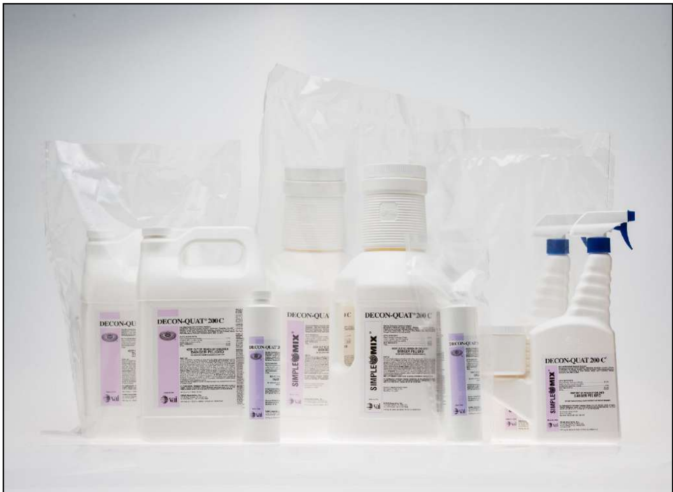
DECON-QUAT 200C Family of Products

(Any specific product label is available upon request.)