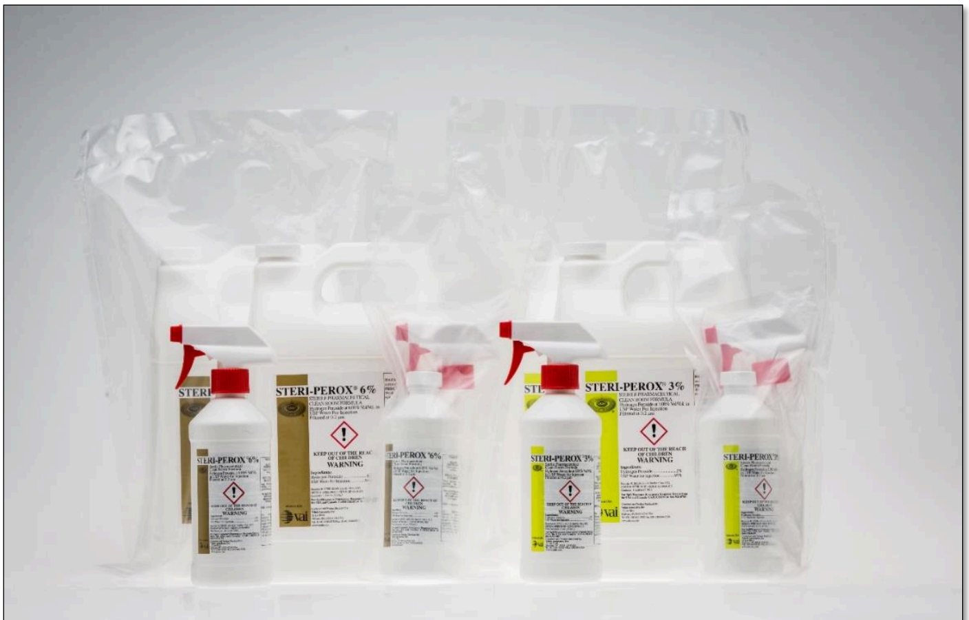
STERI-PEROX 3% and 6% Family of Products

(Any specific product label is available upon request.)