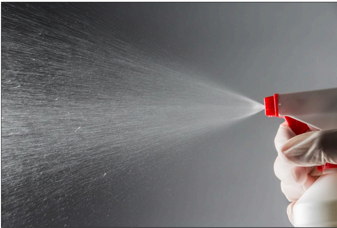
STERI-PEROX 3% & 6% 16 oz Trigger Spray

STERI-PEROX ® solution is used for the cleaning of glass, plexiglass, walls, ceilings, floors, stainless steel, manufacturing equipment, packaging equipment, filling equipment, and most environmental, hard, non-porous surfaces that require the use of sterile hydrogen peroxide solutions in cleaning rotation cycles. STERI-PEROX helps to maintain a critical environment. It is compatible with many types of glove materials.