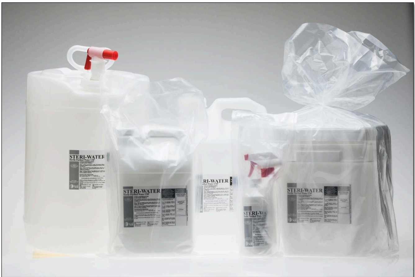
STERI-WATER Family of Products

(Any specific product label is available upon request.)